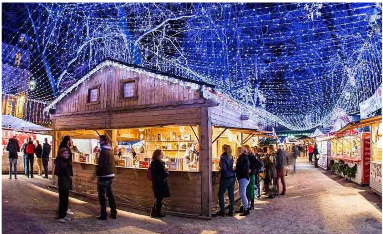
Christmas market in Besançon

I come from Besançon, in Franche-Comté, which is a green region with many parks. It is also a city known for its architectural heritage so it is another similarity with Chandigarh but it is more difficult to highlight the differences because there are numerous. I would say the food first, and the access to it (I still have to be familiar with sector markets). I also feel disconnected with France because usually in Besançon, I would have gone to the Christmas market and I would have felt the year-end celebrations coming. Here even if the weather became (a bit) colder, nothing reminds me Christmas (except a tiny christmas tree in plastic sold on the market).