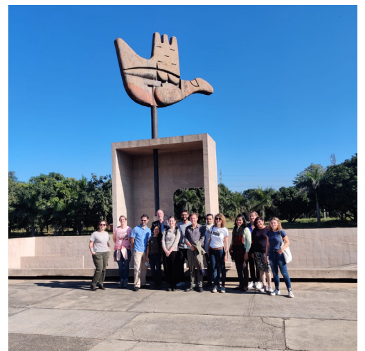
Pictures: Maison Pierre Jeanneret, Capitol Complex & Open Hand Monument